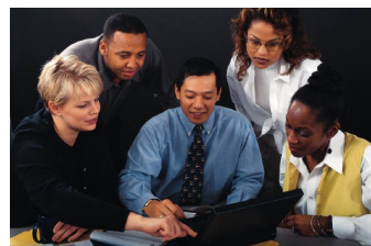
Church Council Retreat